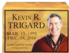
Wood Urn (photo) 5.5" x 9" x 6.25"